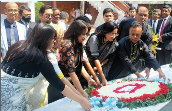
FSA Delegation Laying Wreath at the final resting place of Bangabandhu, March 2023