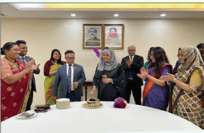
Celebration of Birthday at the Academy, February 2023