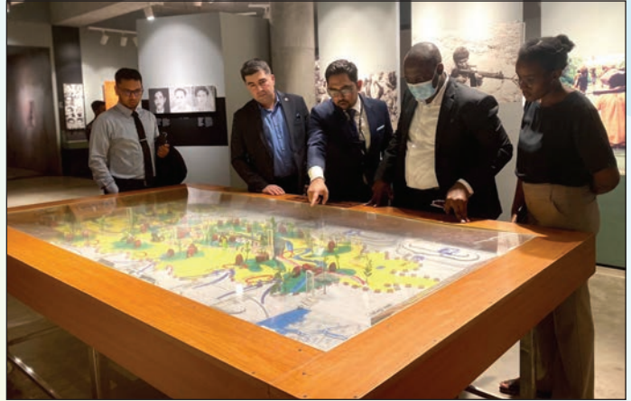
International Trainees explore the Liberation War Museum, June 2023