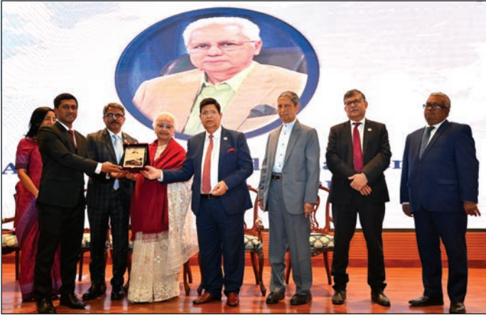
Presentation of Syed Moazzem Ali Memorial Award, January 2023