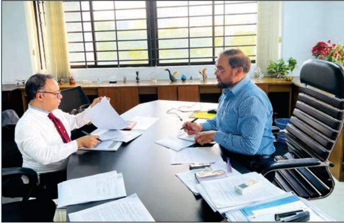
Signing of Concept Note of the PMIRD Programme October 2022