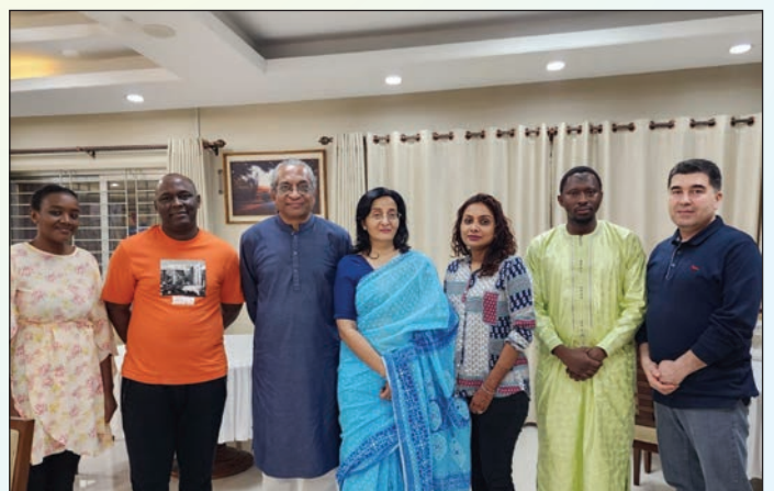
Rector and her spouse visiting the overseas trainees during Eid-ul-Fitr vacation, April 2023