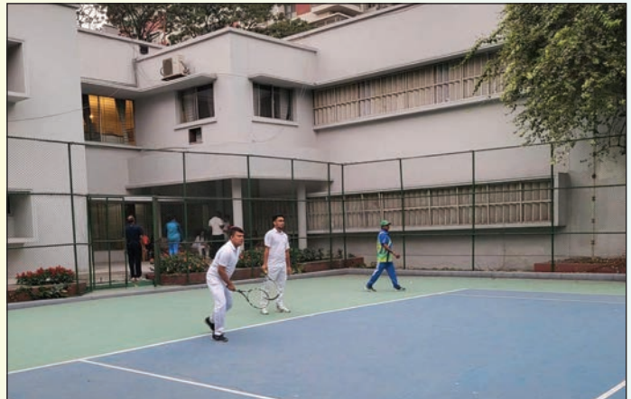
Tennis Session at State Guest House, Meghna, March 2023