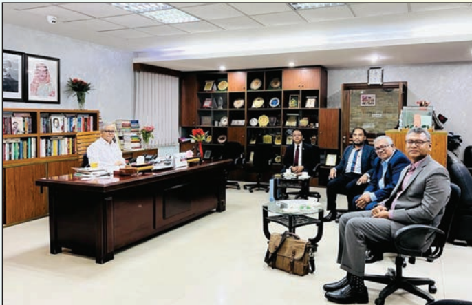
Leaderships of FSA & DUIR meeting with Vice Chancellor, University of Dhaka, October 2022