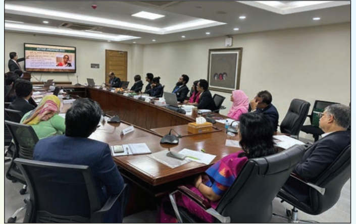
Presentation of Book Review, chaired by Foreign Secretary (Senior Secretary), April 2023