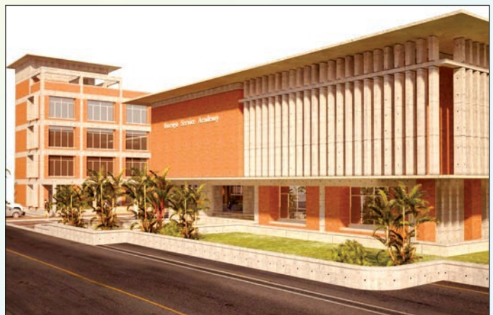
Front Elevation of the New Academic Building of the Academy