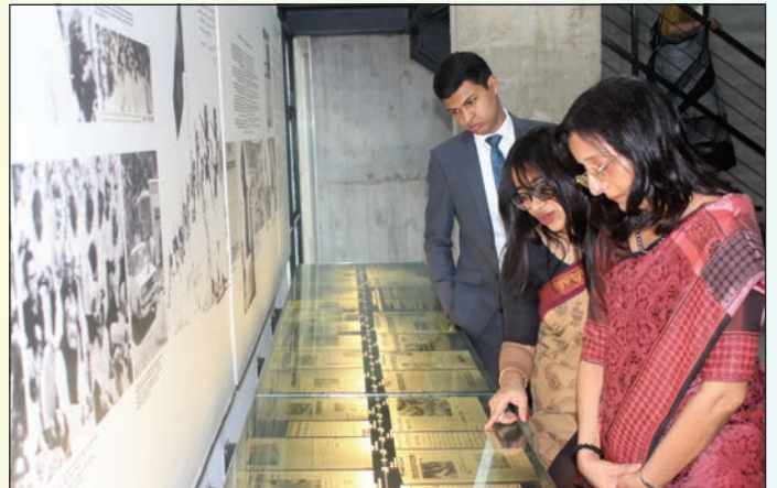
FSA Delegation exploring Bangabandhu Memorial Museum, February 2023