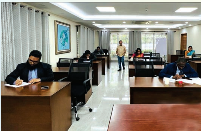
Mid-term Examination at the Academy, June 2023